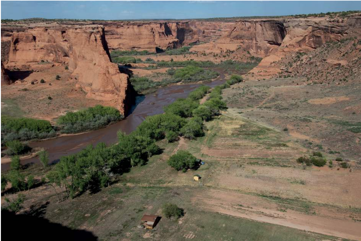
A stream and some desert landforms in the Canyon de Chelly, Arizona, USA